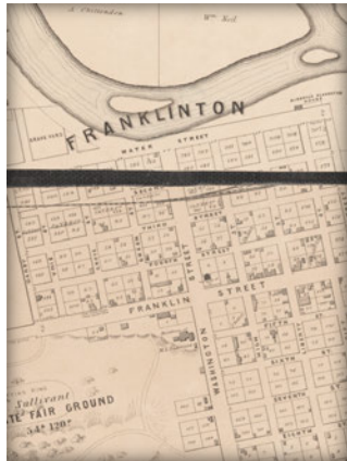
1813 Franklinton, Ohio plat map