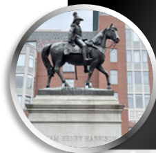
WILLIAM HENRY HARRISON Memorial Statue, Cincinnati, Ohio