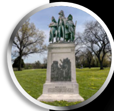
GENERAL ANTHONY WAYNE Memorial Statue at Fallen Timbers Battlefield, Maumee, Ohio