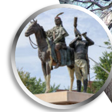
TECUMSEH AND BROCK Memorial Statue, Windsor, Ontario.