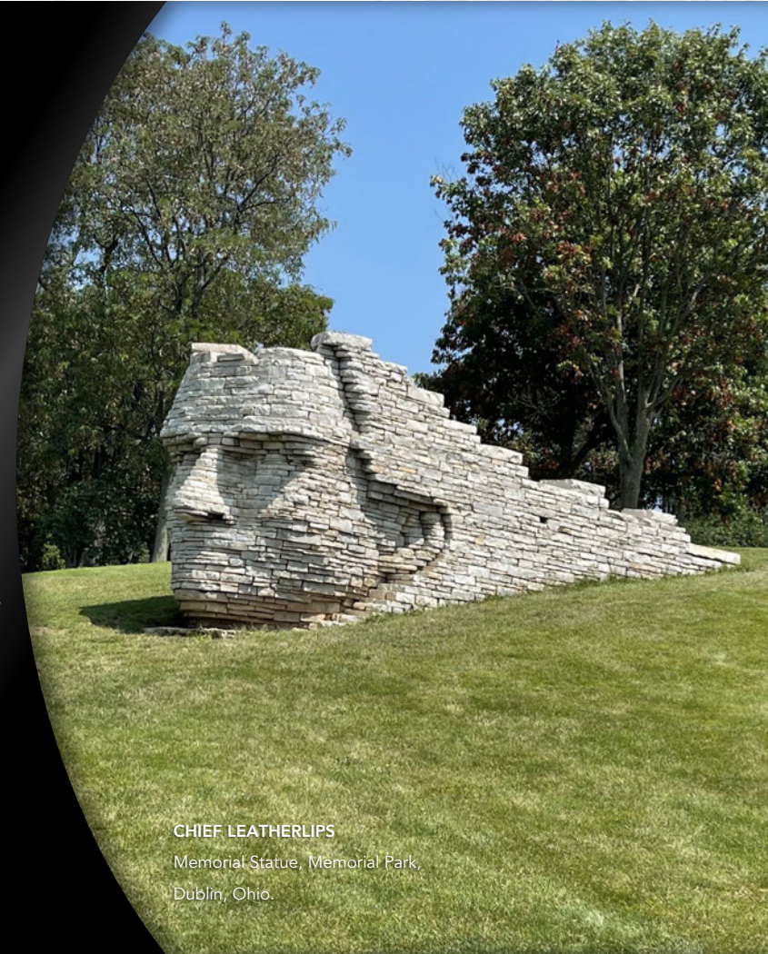
CHIEF LEATHERLIPS Memorial Statue, Memorial Park, Dublin, Ohio.