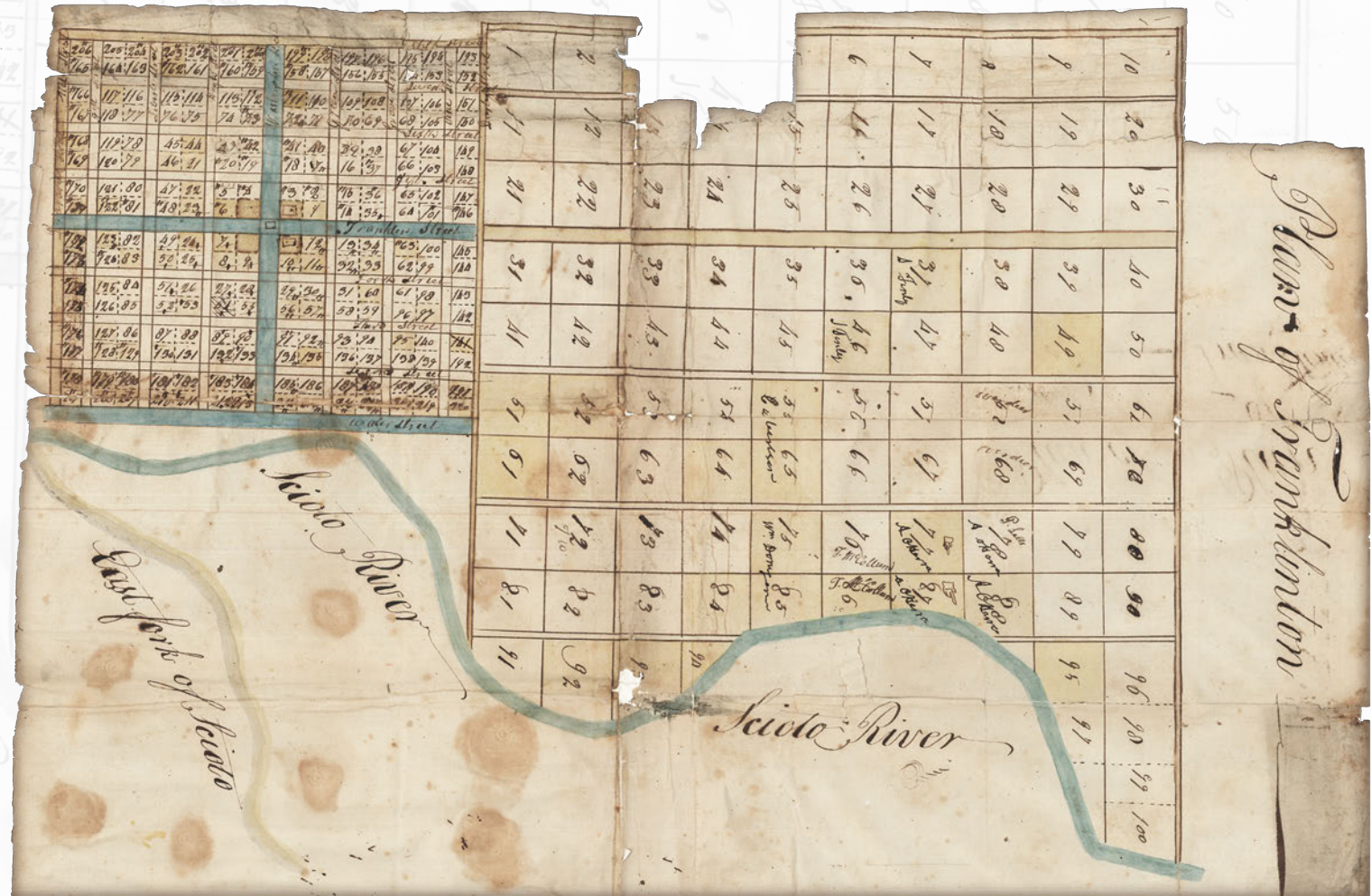
Early plat map of Franklinton