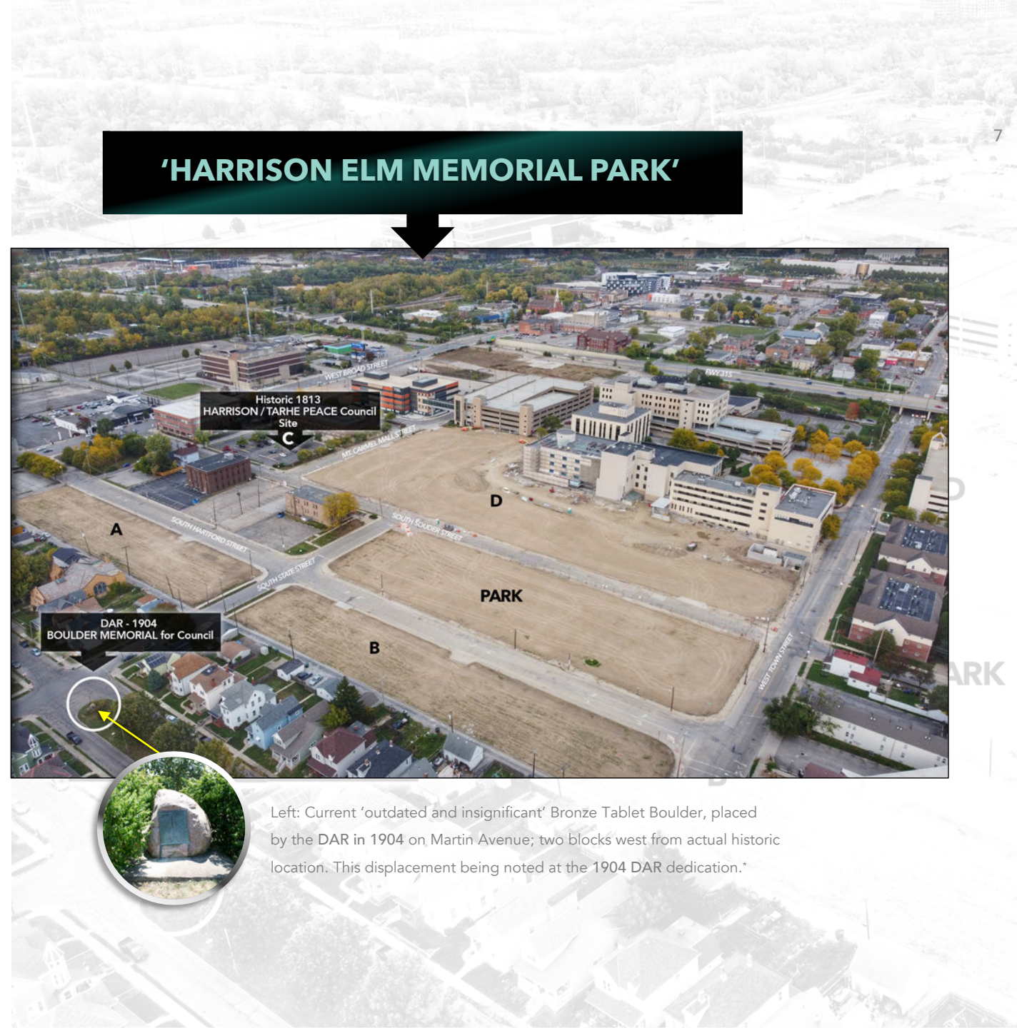
Left: Current 'outdated and insignificant' Bronze Tablet Boulder, placed by the DAR in 1904 on Martin Avenue; two blocks west from actual historic location. This displacement being noted at the 1904 DAR dedication.*

Opportunity to save this history for this preservation park is now.