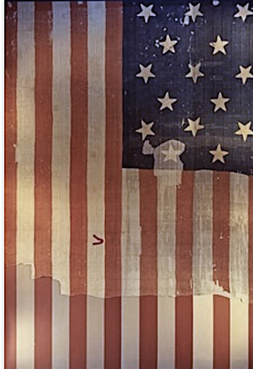
1813 United States Flag